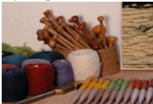
Wool weft yarn, high warp bobbins and beater Photo credit:

Bobbin – Tool on which the weft is wound in an orderly fashion and which is passed between the sheds of the warp. A pointed bobbin is traditionally used in high-warp weaving. A bobbin with two blunt ends is traditionally used in low warp weaving.