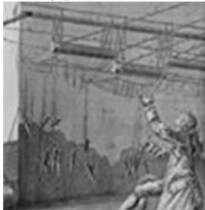
High warp loom with string heddles From Diderot's Encyclopedia 1751-1772

High warp loom – A loom that stretches the warp vertically (perpendicular to the floor).